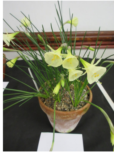
Plants from the February competition.