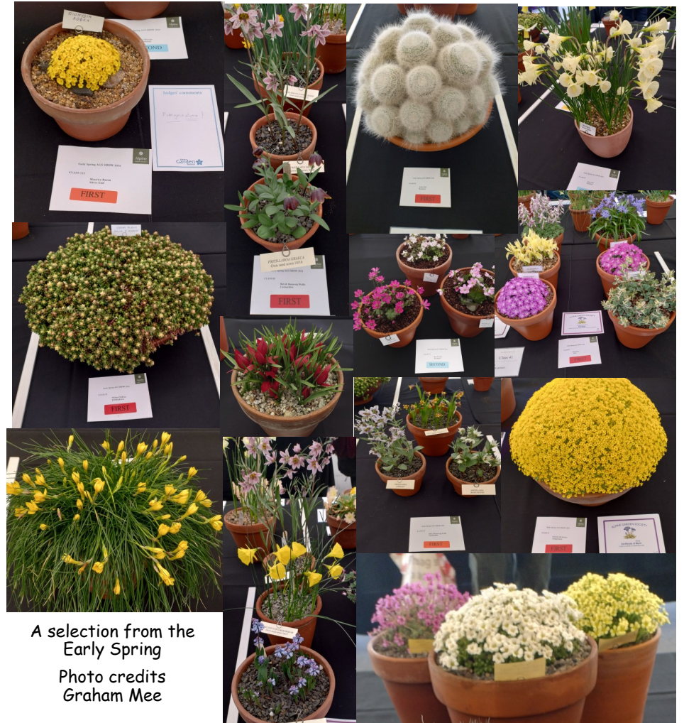
A selection from the Early Spring