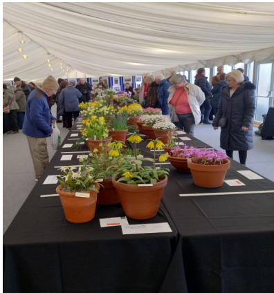
Visitors admiring plants on the show bench, above, at the Early Spring, and right, part of the sales area.