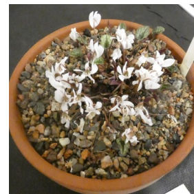
Competition Plants October