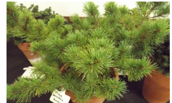
August Competition Plants