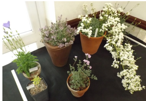
Non-competitive display June

Sunday 20th August 2 until 4pm at Pentlow Mill, Cavendish, Suffolk