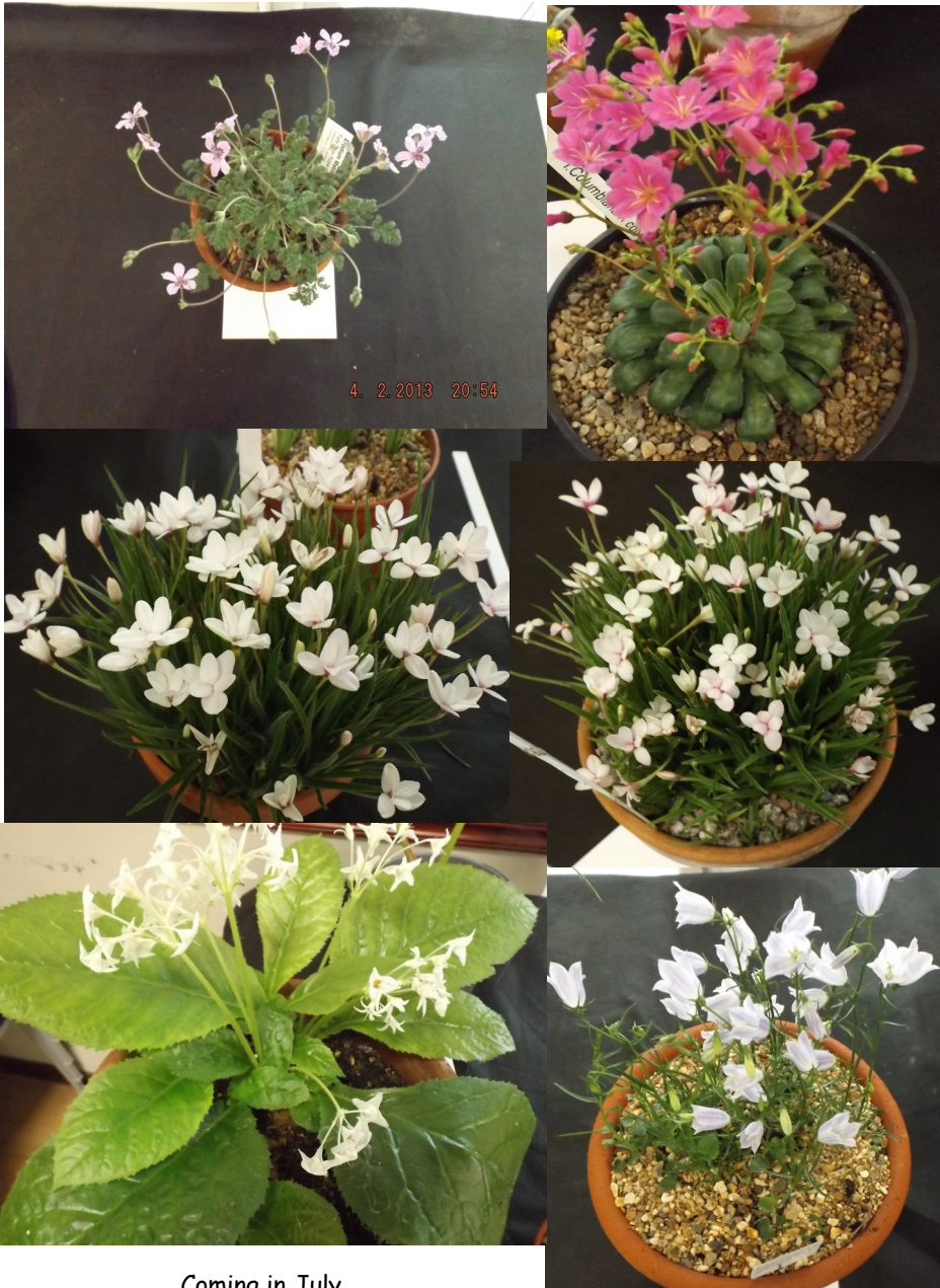
Coming in July