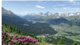
Upper Engadin, Swiss Alps

The subject of her talk is 'The Alpine Flora of the Upper Engadin'