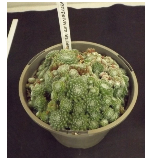
July Competition Plants