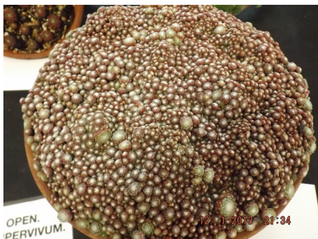
OPEN. PERVIVUM. 12.1.2018 21:34