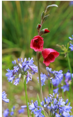
A great talk from Liz last month, showing us the wonderful flora of the Swiss Alps