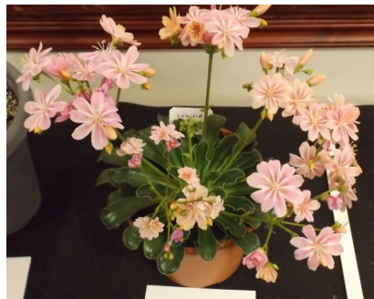
Plants from the April Competition.