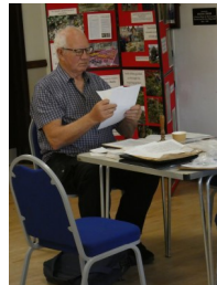
The Man at the Helm