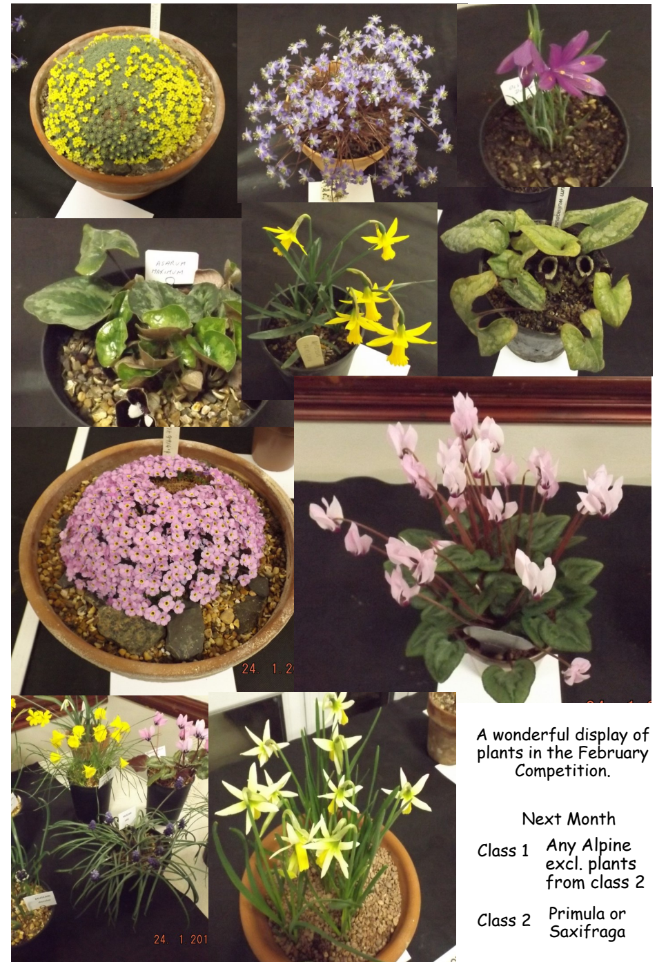
A wonderful display of plants in the February Competition.

On the 29th April is the Essex Groups Show at the Village Hall Rawreth. With this n/l is the Show Schedule and also a poster, that if you can print off and display one somewhere, it will help to attract more visitors. If you have not yet volunteered to help there is still time to give your name to Ruth at the next meeting.