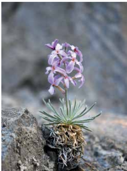
Matthiola valesiaca by Ursula Junker, photographed at Simplon Pass, Valais, Switzerland, won Highly Commended in Class Two of the 2021 Photographic Competition

As a photographic competition, entries will be judged purely on photographic merit. For example, an excellent image of a common plant will rank more highly than a flawed image of a rare plant (even if the rare plant is a superb specimen). Judging is performed by a panel of both current and non-AGS members with appropriate artistic and/or photographic expertise.