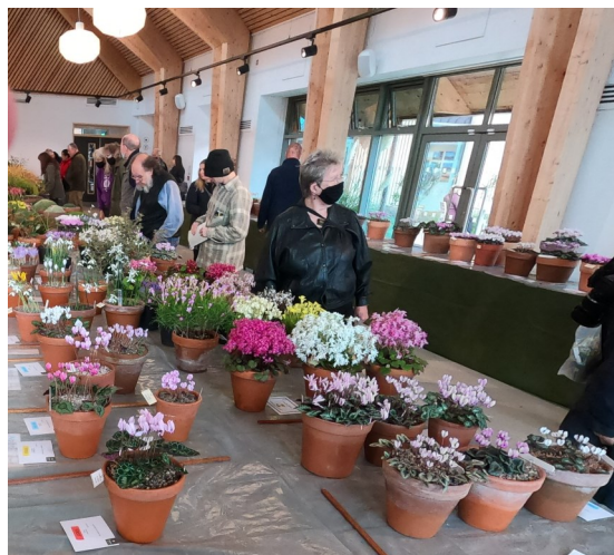
A view of one of the benches at the AGS Show at Hyde Hall on the 23rd.

It was great to see plants back on the bench again after all this time and to see all that colour in the hall.