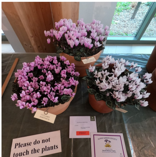
Three Cyclamen Class.