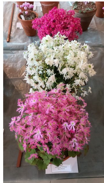
Three Saxifraga Class.