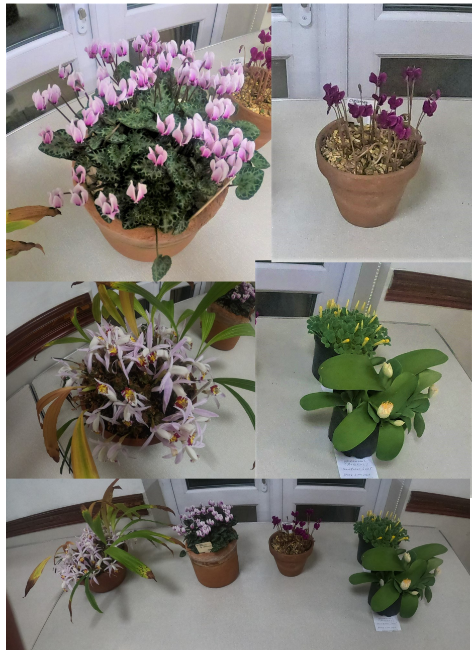
Plants on display at the September meeting.