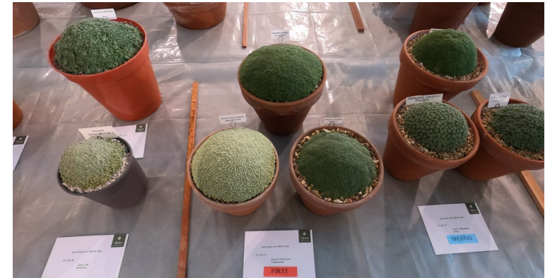
Some beautiful cushions.