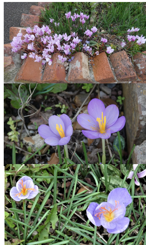
Some plants in my crevice bed.

Cyclamen Hederifolium, they multiply every year thanks to the ants moving the seeds about.