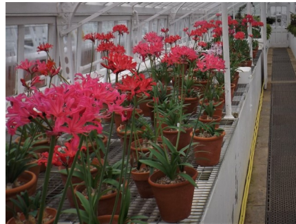
A view in one of the refurbished Victorian Glasshouses at West Dean Gardens, West Sussex, a really lovely old Victorian walled garden. This was in November and the Autumn colours throughout the gardens were wonderful.